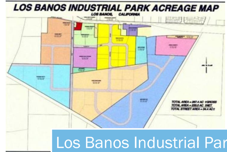
Los Banos Industrial Park 1 to 200 Acres Available