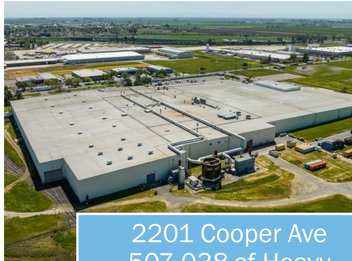
2201 Cooper Ave 507,038 sf Heavy Power/Rail