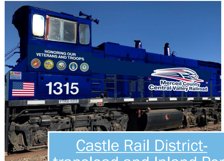
Castle Rail District- transload and Inland Port