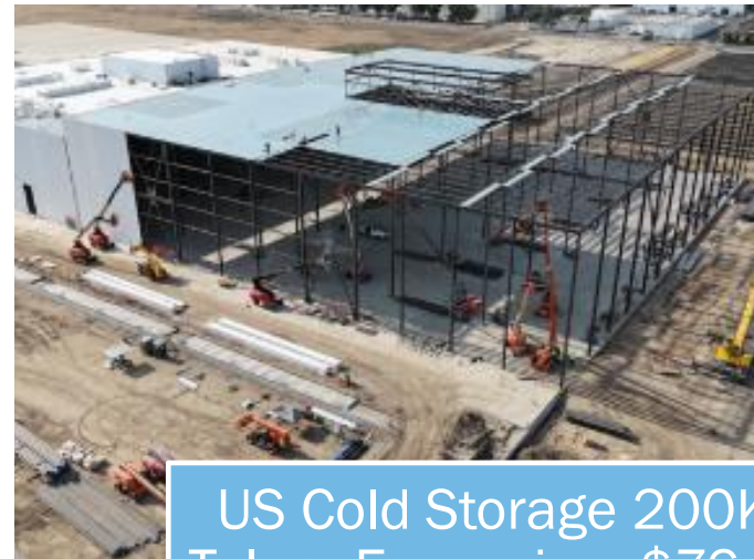
US Cold Storage 200K Tulare Expansion, $76 M