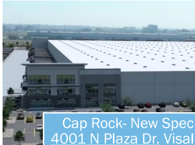
Cap Rock- New Spec 4001 N Plaza Dr. Visalia 1,201,726 sf