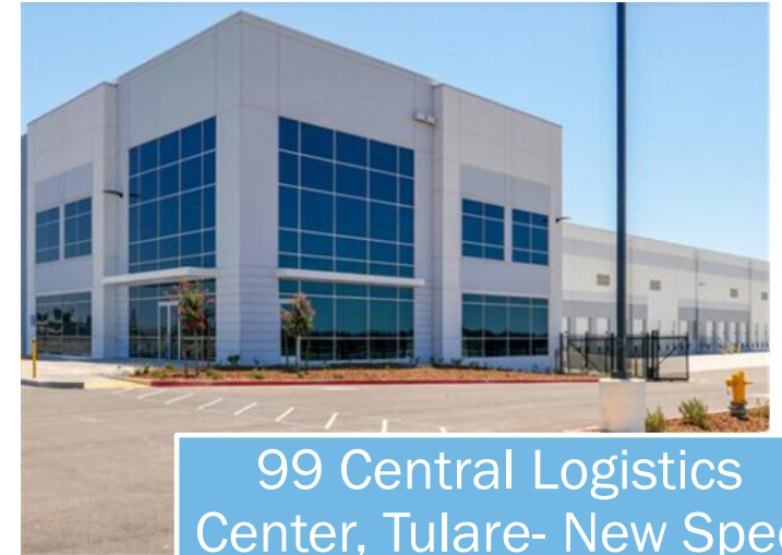
99 Central Logistics Center, Tulare- New Spec 544,077 sf